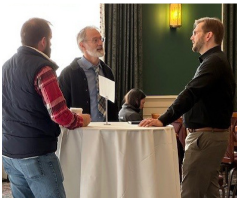
Public and private sector members come together to discuss recent brownfield project issues.