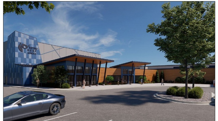
Artist Rendering of the new Metro Deaf School

The Project includes re-surfacing and re-sloping the parking lot to improve accessibility for students who use wheelchairs or have other mobility impairments. Additionally, the metal garage structure that is west-adjacent to the school building will be demolished and an addition to the school will be constructed in its place. The addition will house a gym, additional classroom, office space, conference rooms, storage space, locker rooms, and common areas. The Project will result in the retention of 109 FTE jobs and the creation of 10 FTEs over the next two to three years. They estimate 50 retained construction jobs. The Site is located in an MPCA Environmental Justice Area of Concern.