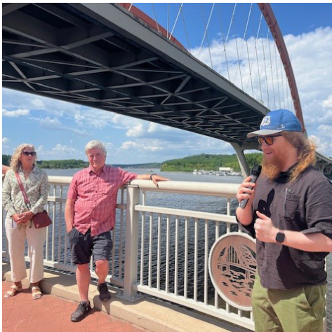
As part of Minnesota Brownfields' annual Spring Tour event, participants began the event by hearing from project experts as they walked the riverfront property.