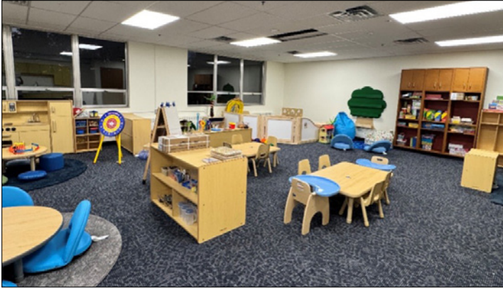
Childcare Center at Clues

coordinated access to other integrated services aimed at improving early childhood health and outcomes, including mental health, family services, employment and housing assistance, case management and resource navigation, benefits screening, etc. The Canasta Familiar food pantry will be on the main floor with a separate entrance. It is anticipated that 15 FTE jobs will be created.