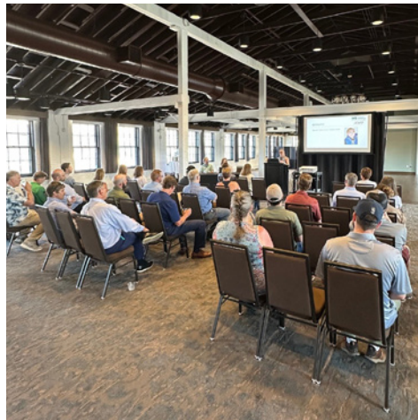
After the walking tour, attendees learned about the unique challenges The Confluence Project faced along with funding opportunities and other project nuances.