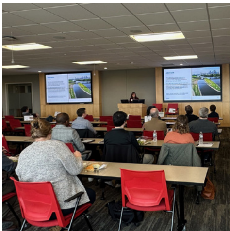
This year, Minnesota Brownfields hosted its first joint event with the Economic Development Association of Minnesota (EDAM) on Site Assessment Grants in the Metro Region.