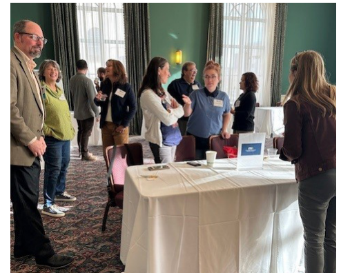
Representatives from the MPCA, DEED, MN Dept. of Ag., MNDOT, Met Council, Hennepin County, Ramsey County and the Capital Region Watershed District were present to answer questions about policies and projects relating to brownfield redevelopment.