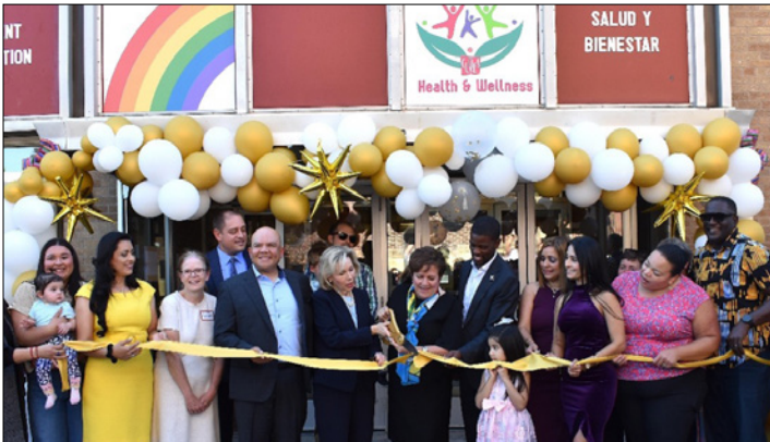
Ribbon Cutting Ceremony at the Clues Early Childhood & Wellness Center