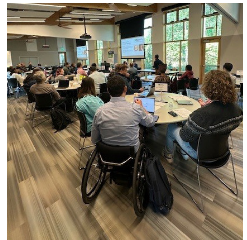
Minnesota Brownfields' highest attended educational event, the Emerging and Diverse Developers Workshop, took place on October 9, at Westwood Hills Nature Center.