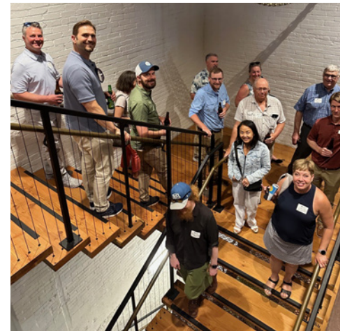
Minnesota Brownfield members tour the recently renovated Confluence Hotel in Hastings, MN. The Confluence project was a 2024 ReScape Award-winner.