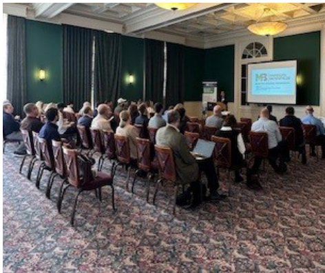
Minnesota Brownfields' annual Meet the Regulators at State of Brownfields event was held at Herbie's in the Park in St. Paul. Attendees learned from speakers through a formal presentation, an interactive open house and a networking hour.